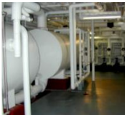
Figure 2. A totally insulated condensate system can pay for itself in thermal efficiency.

Unfortunately, many industrial plants waste the condensate from the steam system and aren't returning condensate to the boiler plant. Condensate being returned still loses thermal energy because of