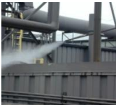
Figure 3. Steam leaks are a loss of condensate and energy.

Another factor is condensate line corrosion. The condensate system accumulates carbonic acid as a result of excessive carbon dioxide in the system. The highest concentration is in the condensate return lines because carbon dioxide dissolves in cooling condensate. Most condensate lines use Sch 80 steel pipe and threaded connections. Condensate corrodes steel, but the pipe threads typically are more susceptible to deterioration. Using stainless for condensate pipe and valves, and avoiding threaded connections, slows the corrosion.