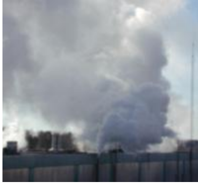
Figure45. Steam blowing to atmosphere represents a great loss of steam and condensate.

The fourth factor is condensate system insulation. Steam system components should be insulated to ensure the thermal energy in the condensate isn't lost in transit. Also, insulation protects personnel from contact with hot components, thus improving plant safety. Everything in the condensate system at a temperature above 120°F (49°C) needs insulation, including: